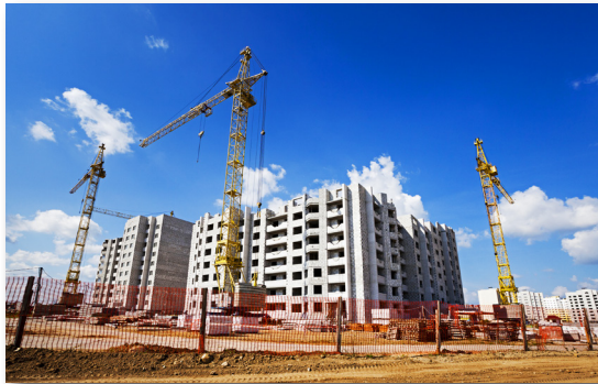
MECHANICAL & ELECTRICAL CONTRACTORS

Marking Services is well-versed in the identification marking needs of virtually every kind of facility. We can make pipe marker, valve tag, hazard identification, and safety sign recommendations that provide greater value to you than boilerplate products or specs that are out of date. Providing valuable identification services and products to a wide variety of commercial and industrial industries, we are well versed in requirements and regulations for identification marking.