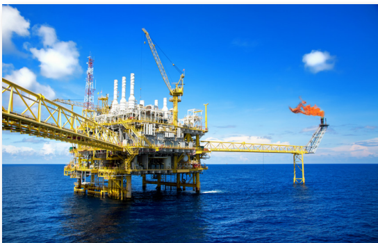
MARINE AND OFFSHORE