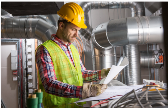
ENGINEERS AND ARCHITECTS